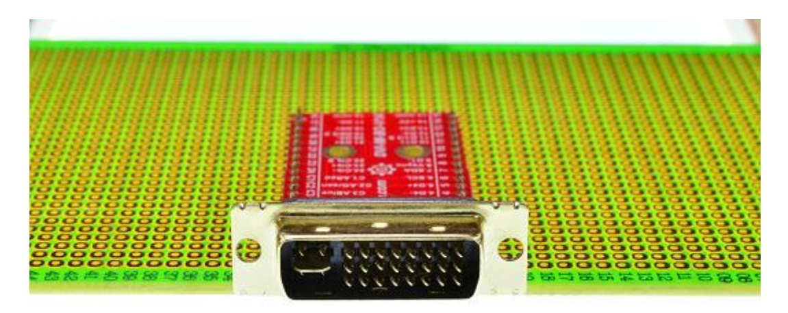
Figure 4: Solid Mounting on prototype PCB