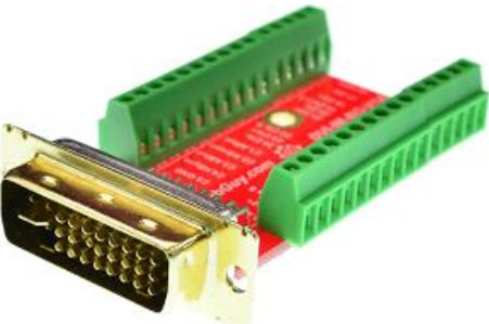
Figure 3: DVI-IM-BO-V1A various connections